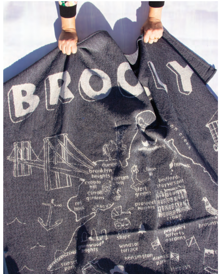
Brooklyn Knit Throw Blanket (Heather Navy) - Retail: $150.00