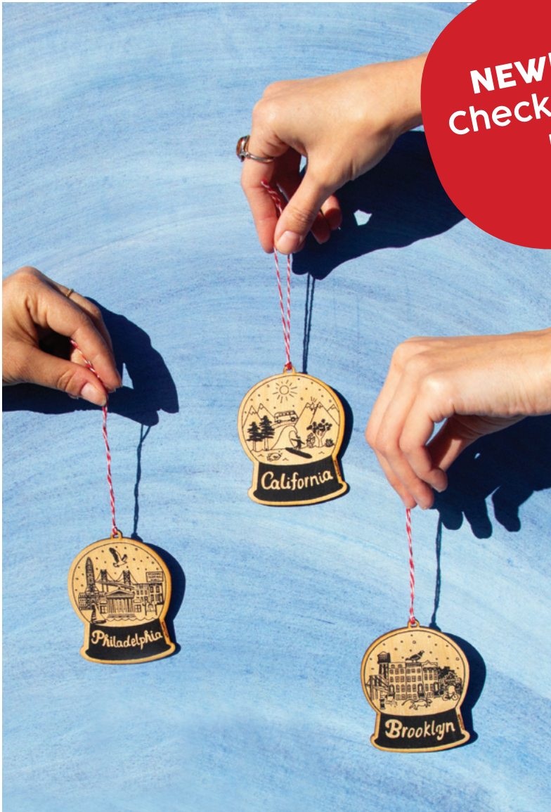
Wood Ornaments - Retail: $13.00