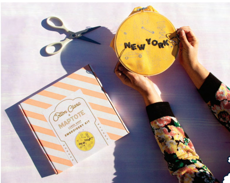
Cotton Clara x Maptote Embroidery Kit - Retail: $30.00